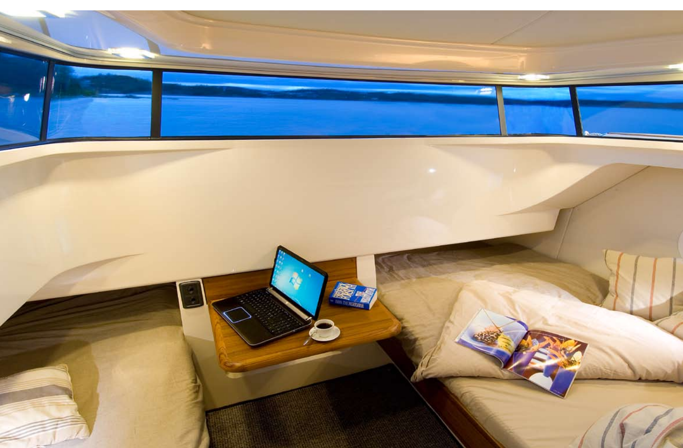
The spacious aft cabin includes 3 berths and a 180 degrees panoramic wraparound window line. You will find big lockers beneath the beds. The cabin also has five superb size storage lockers and a table that can be folded out and be uses as pc work desk or for children to play. The headroom is a generous 191 cm high.