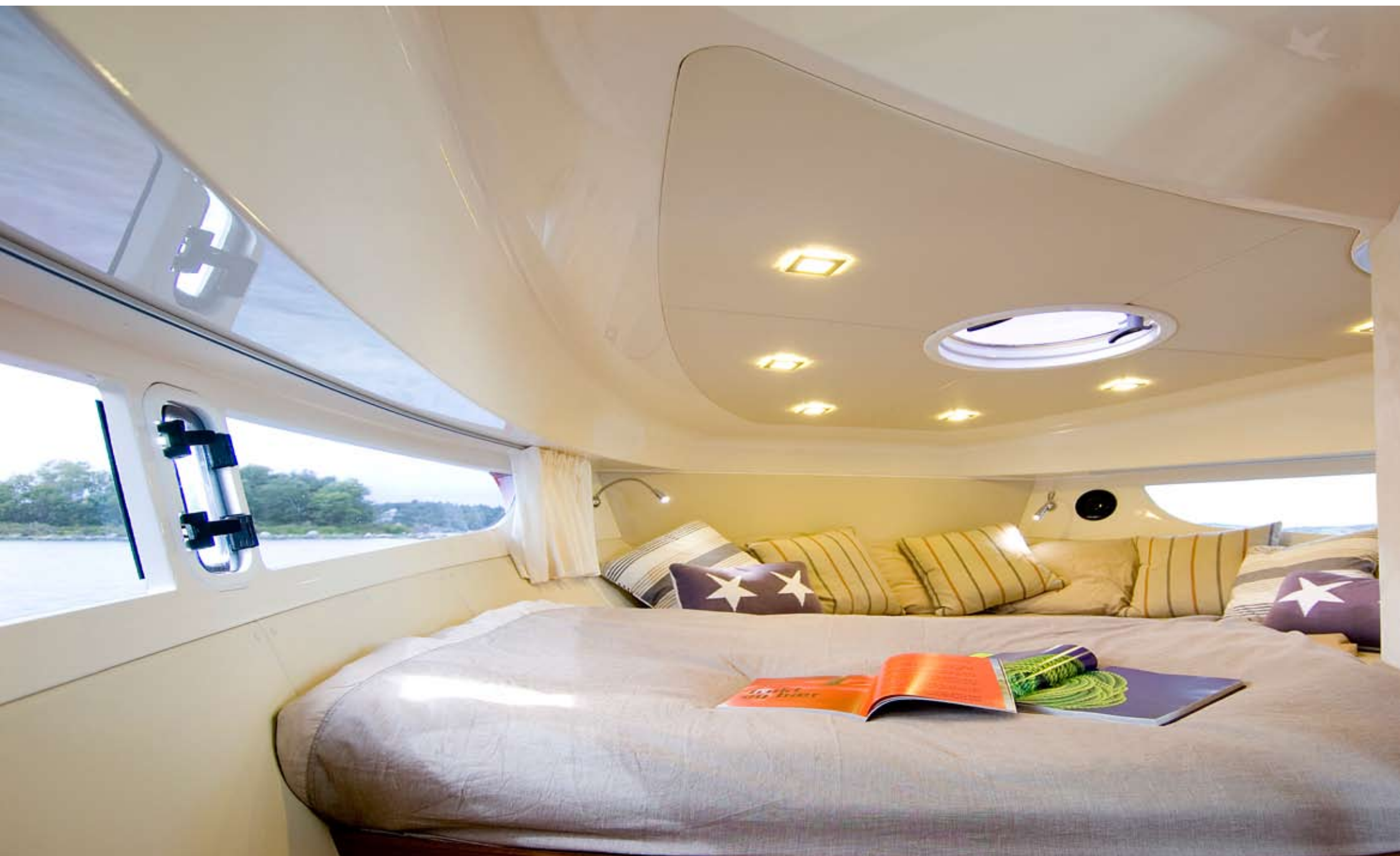
The extraordinary spacious front cabin offers lots of light through the huge windows in the hull. You are perfectly in contact with the water and nature. The headroom is generous 201 cm high and the huge bed is circular 2.1m in diameter.