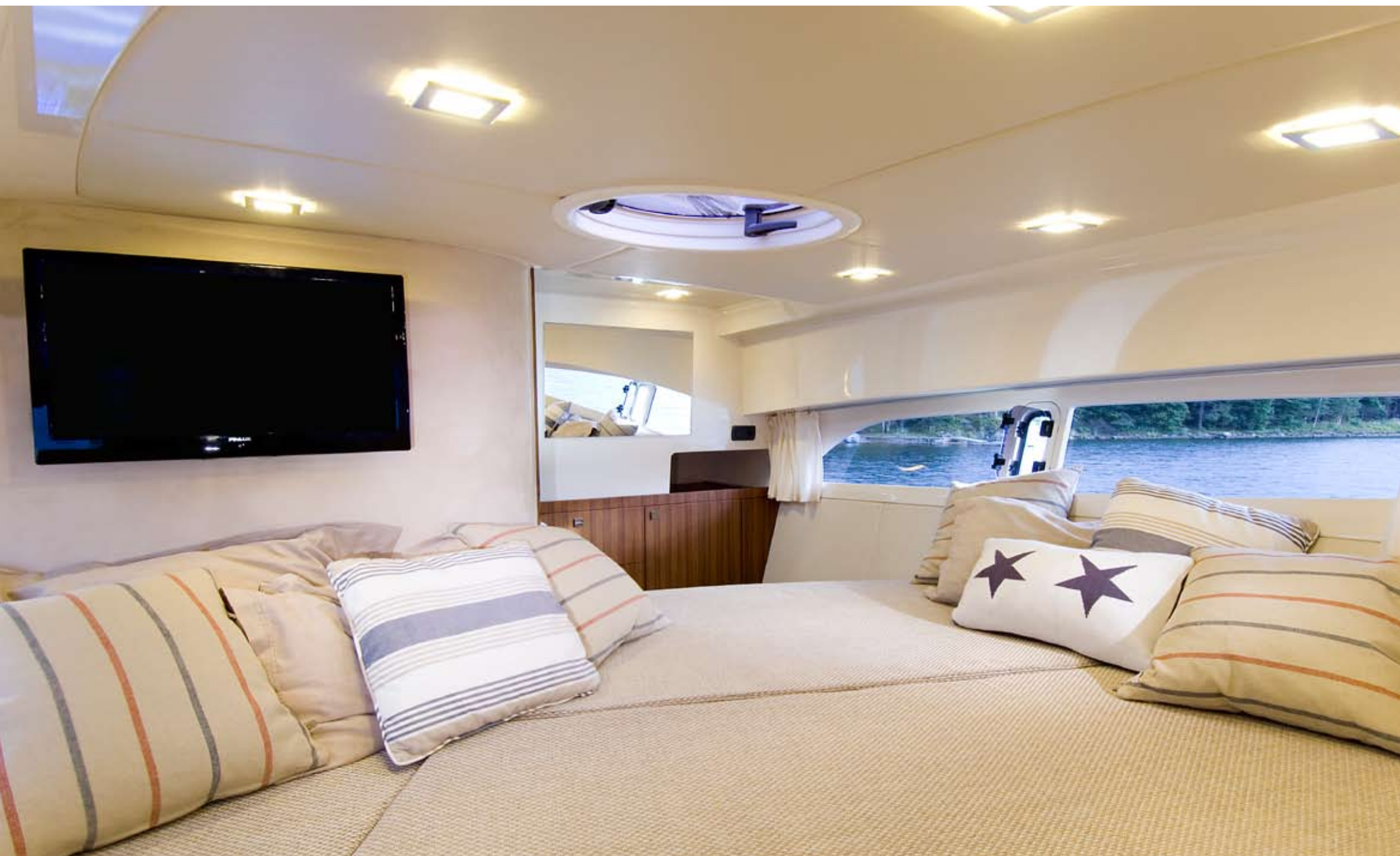
Beneath the bed you will find a huge storage locker. Opposite the bed we have installed very generous size cabinet and drawers. Flat screen TV can be fitted on the wall as extra. The cabin offer 3 hatches for ventilation.